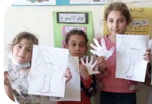
Learners are sharing their activities in Bekaa during the homework support program

Implementing teachers received capacity building based on the 'Quality Teaching and Learning' model and were equipped with resources aligned with the curriculum. Parents and caregivers were engaged and provided with instructional materials for wellbeing and creating supportive home learning environments.