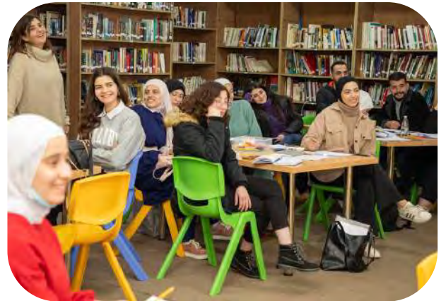
Teacher Support Training