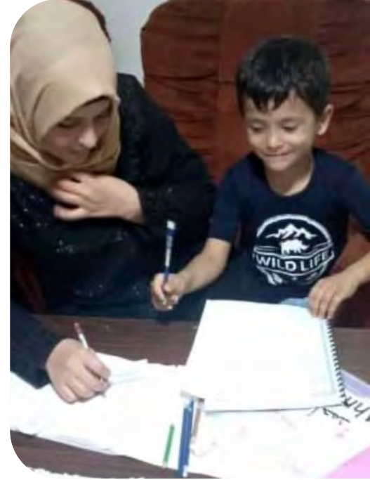
→ A child in the ECE program engaged in practicing a lesson shared remotely while receiving his mother's support

In partnership with a generous donor who wishes to remain anonymous, Ana Aqra completed the “I Can Always Learn” project that was designed in response to the exacerbating disruptions in education caused by the spread of COVID-19 and the adverse implications of Lebanon’s dire economic situation. The program aimed to fill pre-existing gaps caused by either non-stimulating environments for children who are not yet enrolled in school or school disruptions for those who are. Via remote learning, the project provided early childhood and retention support education services to children ages 4-6 and 6-8 respectively. The project also delivered the “I Can Also Teach” program, which engaged community stakeholders, particularly parents and caregivers, in supporting the active learning environment by building their capacities and skills in early literacy and child development milestones. Through teacher training and coaching sessions, the project built the teachers’ capacities in quality teaching and learning, and teachers adopted their best practices in support of distance learning.