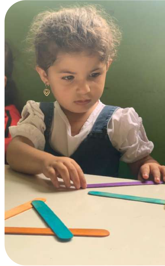
▶ A child in the ECE program building shapes with manipulatives