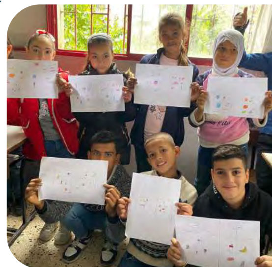
Children sharing their work

In partnership with Luminos, the Second Chance project provides direct services to children in Baalbek and the Beqaa regions. Basic literacy and numeracy sessions are offered to 325 out-of-school children aged 10-14, helping them transition to formal education. Additionally, 300 learners in public schools receive remote homework support to enhance their academic performance and well-being. A summer remedial program assists 300 at-risk learners in closing achievement gaps. Ana Aqra trains 80 caregivers in literacy and numeracy skills to support their children's education at home. The project aims to improve access to education and provide better prospects for children's future.