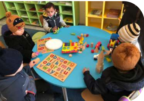
→ ECE children engaged in hands-on activities at our community-based center in Baalback

Ana Aqra, Lebanese Alternative Learning (LAL) and Al Fanar joined forces to provide quality teaching and learning materials for the enrolled children and caregivers. 100 digitized lesson units with tips for teachers and parents were developed for the 2021-2022 school year. In the upcoming phase, the lessons will be reviewed and published on LAL's and other platforms. These lessons support effective use of interactive materials and online tools. Ana Aqra will implement the project in Baalback, benefiting 180 learners with 2 cycles of early childhood education. The pilot implementation will assess the lessons' impact on children's performance.