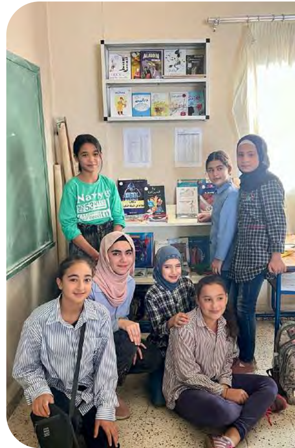
Grade 6 learners in Sheikh Mohammad Mixed Public School using the classroom library

The Learning Recovery Program was the focus of QITABI2 interventions in 2022. The project supported CRDP with the preparation of content and materials and the roll-out of National Teacher Training on learning recovery. Two training phases, LR2 and LR3 were conducted between March and December 2022 targeting respectively 6,580 and 4,692 unique teachers in Akkar, North Lebanon, Baalbeck/Hermel, and Beqaa regions. The training was followed by in-school support visits to support teachers with the set-up and use of project resources and with the assessment of the program impact and learners' performance. In 2022, the QITABI2 project launched and completed the first round of food parcel distribution targeting caregivers of learners in grades 1 to 6 in all primary public schools. The purpose of the activity is to provide vulnerable public school families with basic nutrients that are essential to ensure students retain in school during this challenging period in Lebanon. QITABI2 also supported MEHE with the implementation of the 2022 summer program. A total of 487 primary public schools and around 80,000 learners across Lebanon benefited, during 6 weeks of implementation, from academic, extracurricular, and SEL activities designed to cover a two-year learning loss.