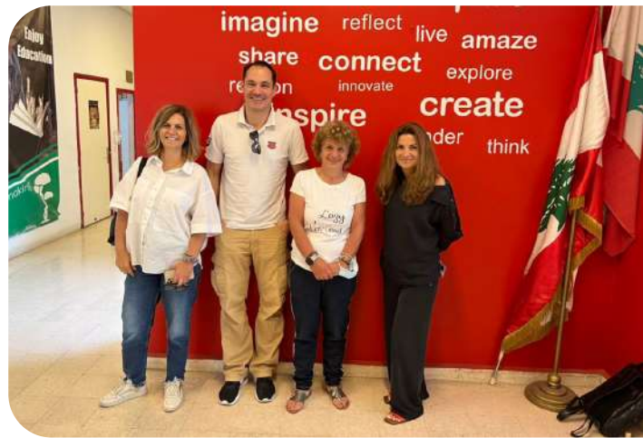
Save one school at a time - Dhur Shweir Public School

Additionally, we allocated funds to support school operations and create safe and enabling learning environments. We firmly believe that providing the necessary resources and facilities is essential for the overall well-being and growth of students within the school.