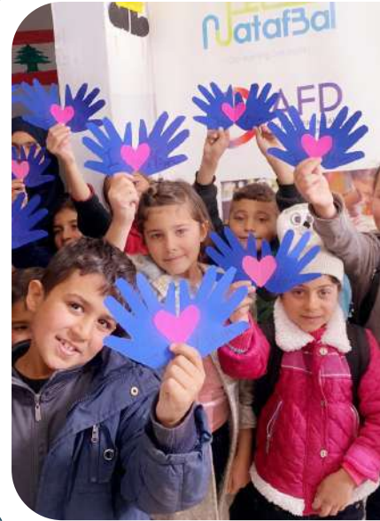
Nataf3al learners celebrating the Children's Day

Over a three-year period, the project will support 20 public schools in Beirut, Mount Lebanon, Beqaa, Baalbek, and Akkar, targeting the most vulnerable areas. Through partnerships with the Ministry of Education and Higher Education (MEHE), the center for education research and development (CERD), and consortium members including Ana Aqra, Amel Association, and International Alert, Nataf3al will impact over 12,000 learners, 600 teachers, and 3,200 parents.